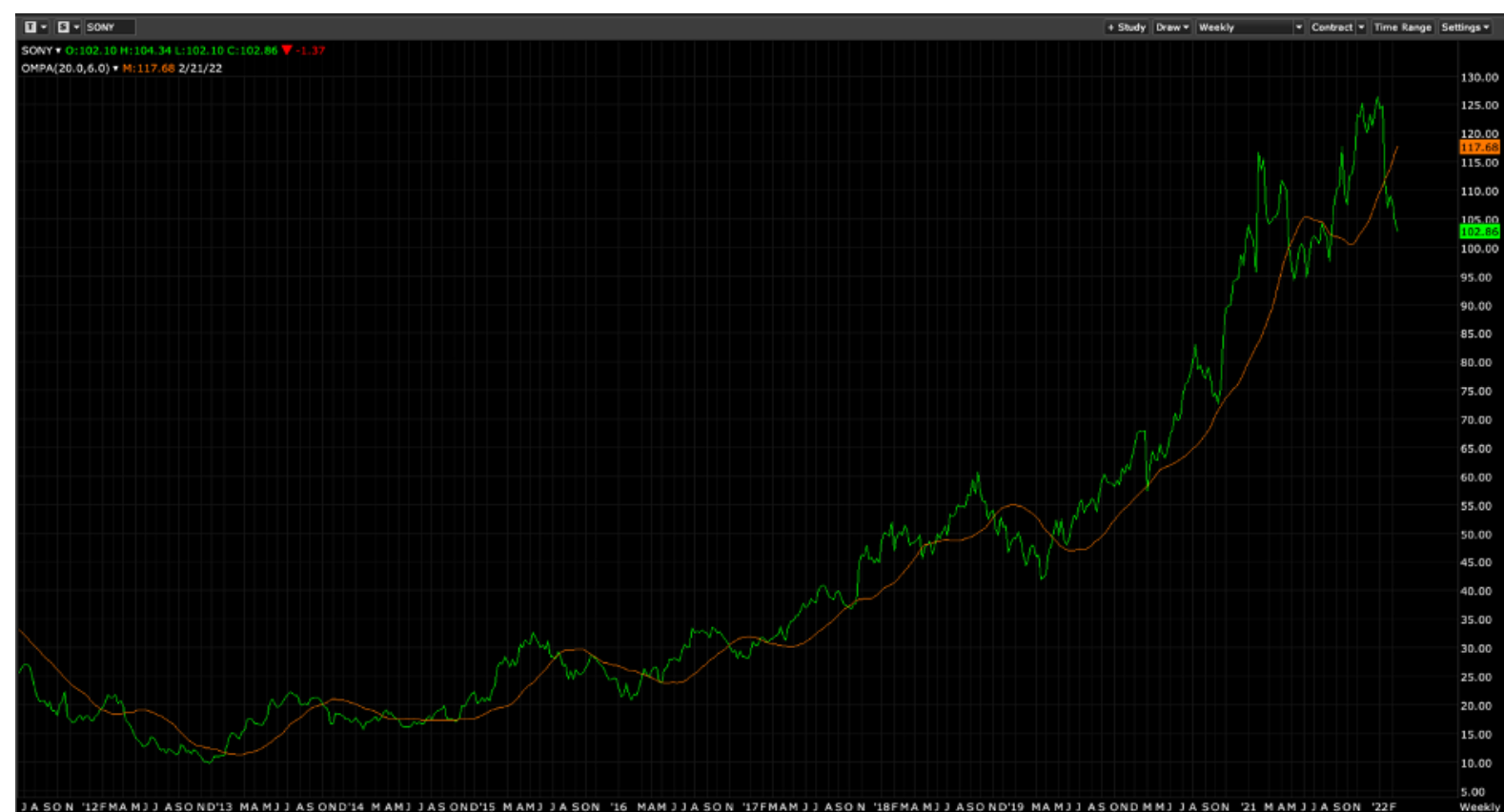
Chart by QUODD

The green line shows a weekly price, while the orange line illustrates a smoothed moving average price.